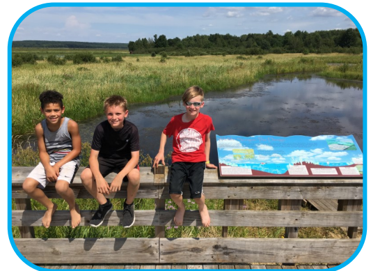
YMCA Summer Day Camp Field Trip