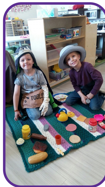
YMCA Summer Day Camp