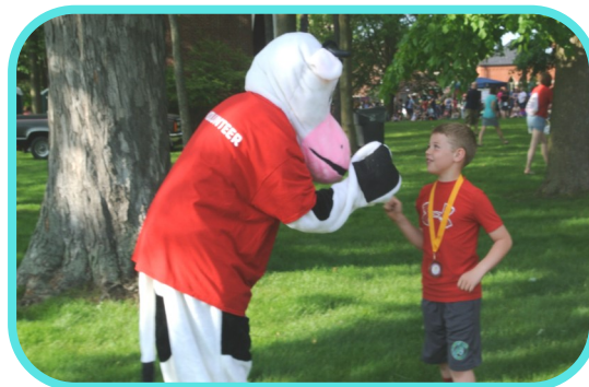
YMCA Cheese Chase Kids Dash