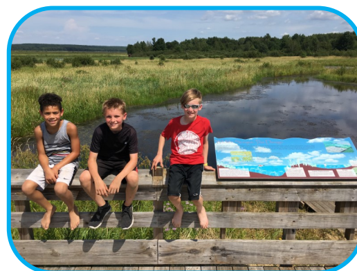
YMCA Summer Day Camp Field Trip